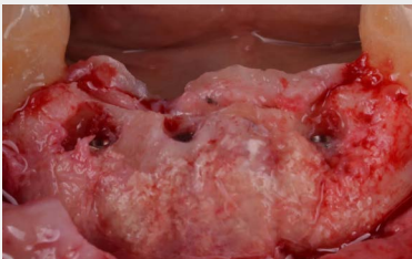
Frontal view of re-entry at four-month follow-up