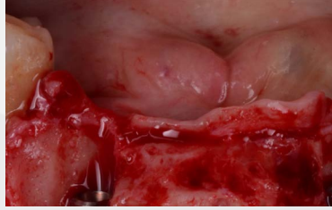
Hybrid-design implants with sufficient primary stability