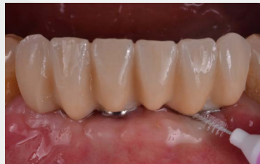
Clinical evaluation at two-year follow-up