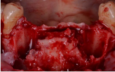
Extraction-related large bone defects