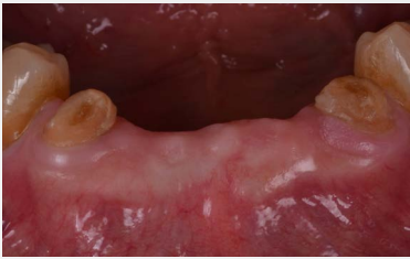
The baseline case scenario