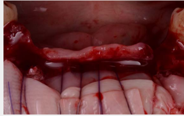
The OSSIX® Plus was stabilized by suturing subperiosteally