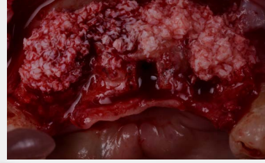
A xenograft was used to gain volume