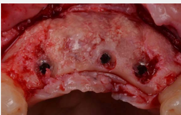
Occlusal view of re-entry at four-month follow-up